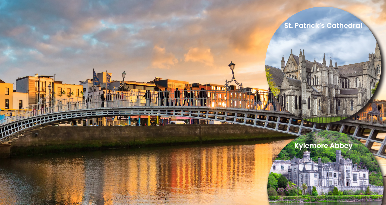
St. Patrick's Cathedral